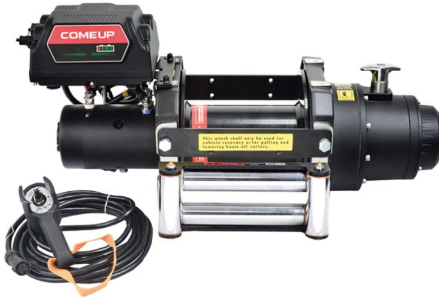
Rhino 12 Pro PN 851105 (12V) | PN 851324 (24V)