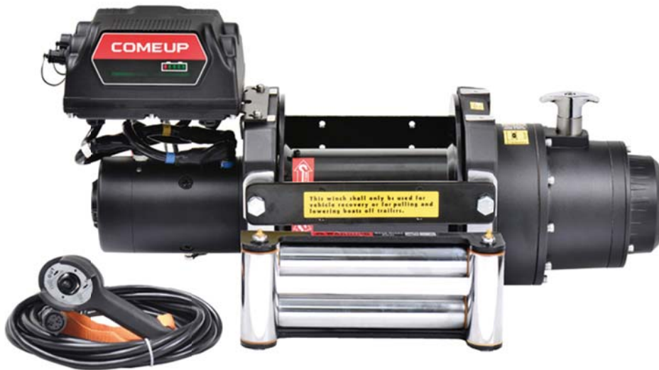
Rhino 15 Pro PN 855126 (24V)