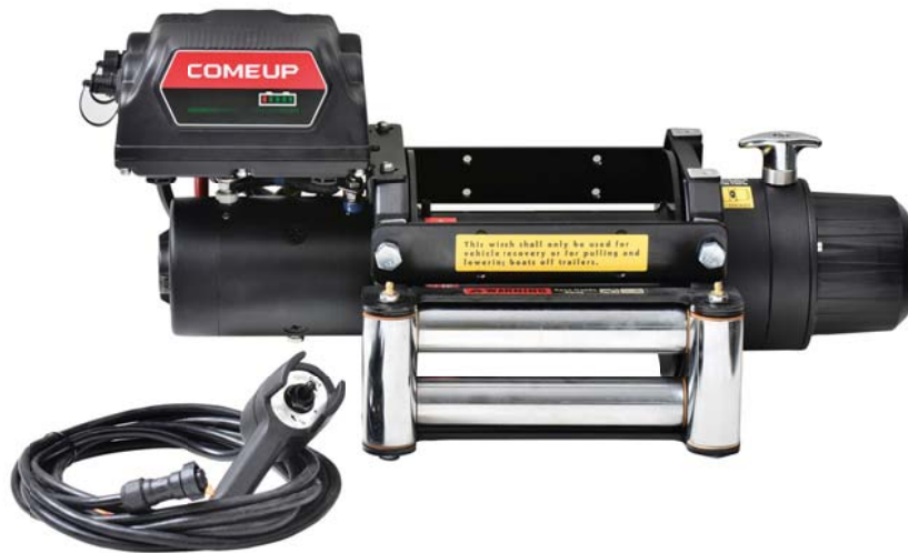
Rhino 8 Pro PN 850318 (12V) | PN 850326 (24V)